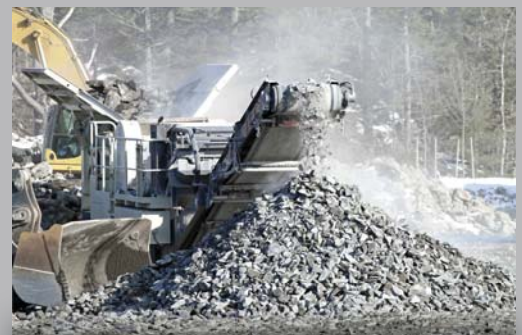
PORTABLE with ANGLE SENSOR

Daily, weekly, monthly, yearly, and resettable job totals, along with calibration and production data logs are stored on the internal USB drive for verification of production at each jobsite.